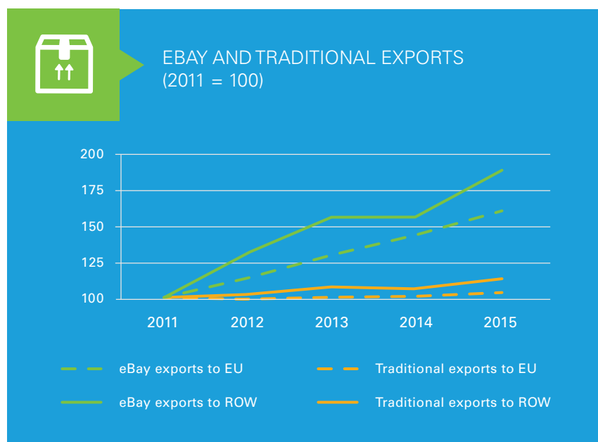
FIGURE 1.1 COMMERCE OVER DISTANCE

Even within the EU, geographical distance has a negative effect on cross-border activity. However, the detrimental effect of geographic distance on trade within the EU is more than four times lower when commerce is conducted leveraging the online commerce platform model, as compared to traditional cross-border trade. 7 This can also be seen in the 62% growth rate of EU cross-border commerce over the eBay Marketplace for the period 2011 to 2015, compared to the modest growth of 9% for traditional commerce.